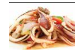
Sauteed Spicy Squid