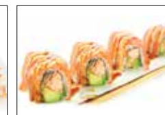
Orange Dragon Roll