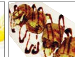
Duck Pancake Roll