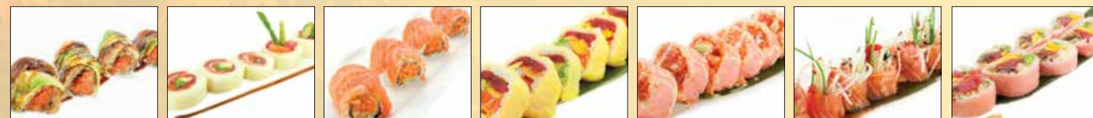
Precious Roll Naruto Roll Crazy Salmon Roll Manhasset Roll Triple Spice Roll Butterfly Roll True Love Roll