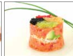
Spicy Tuna Tartar