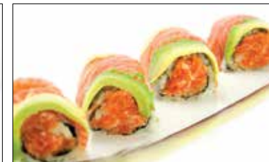
Beauty Alaska Roll