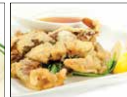
Deep Fried Soft Shell Crab