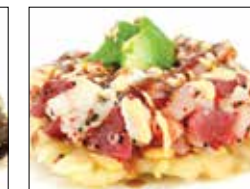
Aki Sushi Pizza