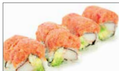
Michelle Special Roll