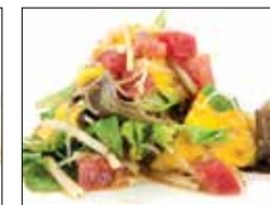
Mango & Tuna Salad