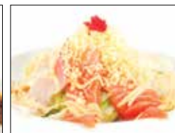
Friendship Bowl Salad