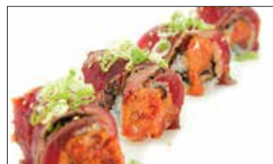
Crazy Tuna Roll