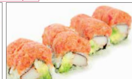
Michelle Special Roll