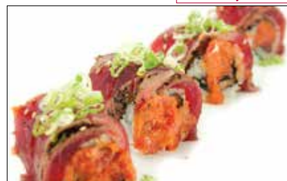
Crazy Tuna Roll