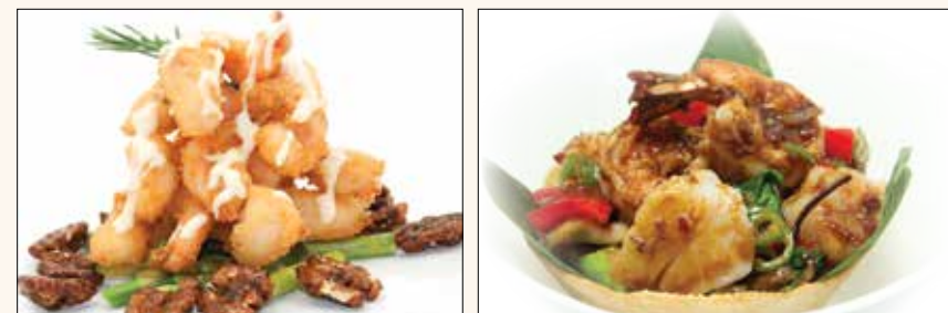
Crisp Shrimp w. Honey Walnuts