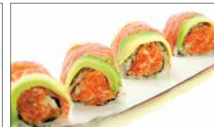
Beauty Alaska Roll