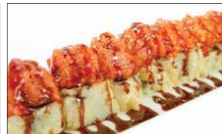
Spicy Girl Roll