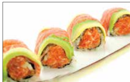
Beauty Alaska Roll