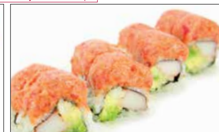
Michelle Special Roll