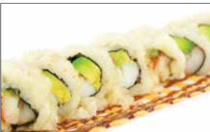
Spring Jamie Roll